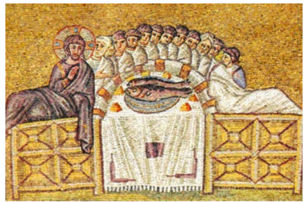
6th century Mosaic - Sant'Apollinare Nuovo, Ravenna